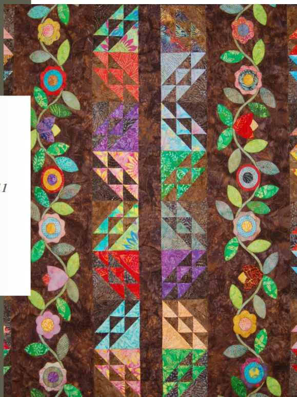
Detail from the 2011 Raffle Quilt