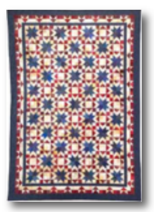
From left: Tillie's Treasures Prairie Gems Star & Crown (See her website for other Small Wonder quilts).

Oct 7 Picket Fence —5 Quilts to choose from. The picket fence unit is made with the sew & flip method. No triangles to cut or bias to work with. Pat will have handouts with design variations and how to make your pieced border fit your top.