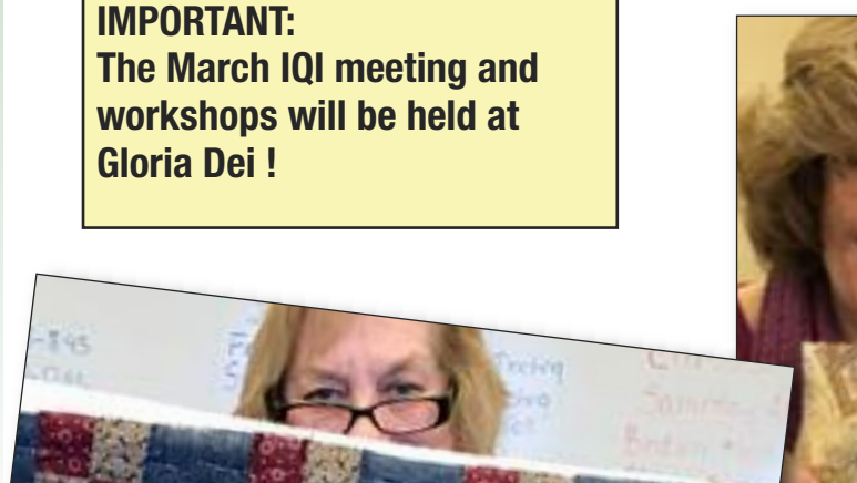
We LOVE Quilt-In!