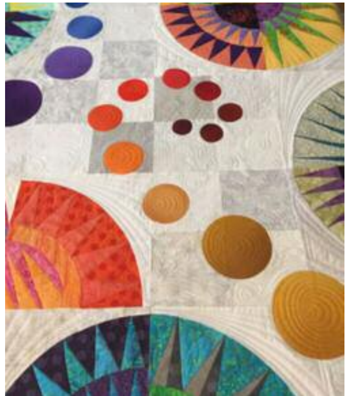
"With Liberty and Dots for All" quilt