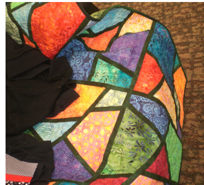
Harriet Bertsche - Stained Glass Quilt Class