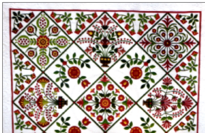
The Viewers' Choice Top Quilt "Bed of Roses" (detail) by Donna Derstadt