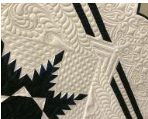
Gorgeous 2016 IQI raffle quilt!