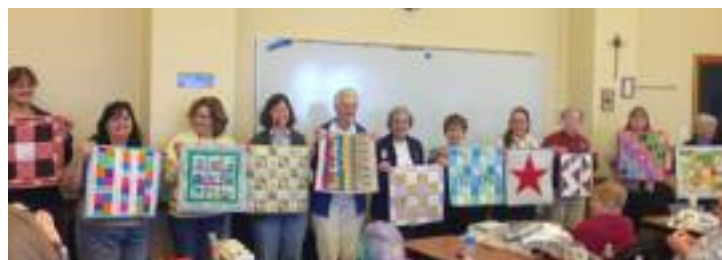
Service quilts for newborns shown at the Quilt In.

Our next Service Saturday will be on March 21st. Hope to see you then.