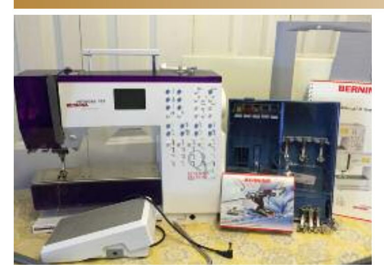
Bernina Virtuosa 153 Quilters Edition $625.00

Included with the sewing machine: carrying case foot pedal 8 feet knee lift slide on table power cord. 8 feet: 57,5,4,10,1,20,5 free-motion and walking foot Email angel.sidor@gmail.com Cell 847-508-0976