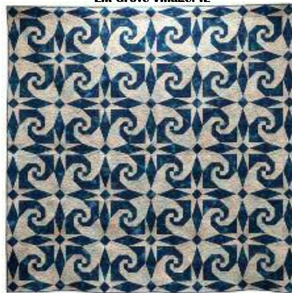
Raffle Quilt: "Snails in the Blueberry Patch" 99" x 99"

Holiday Inn Elk Grove, 1000 Busse Road, Elk Grove Village, IL