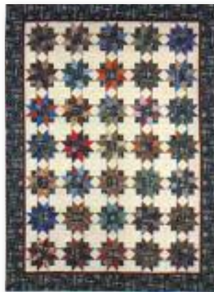
From left: Millennium Star Pinwheels on Parade Dawn to Dusk (See her website for other Picket Fence quilts).

Oct 7 Picket Fence —5 Quilts to choose from. The picket fence unit is made with the sew & flip method. No triangles to cut or bias to work with. Pat will have handouts with design variations and how to make your pieced border fit your top.