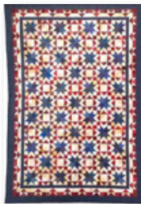
From left: Tillie’s Treasures Prairie Gems Star & Crown (See her website for other Small Wonder quilts).

Oct 7 Picket Fence —5 Quilts to choose from. The picket fence unit is made with the sew & flip method. No triangles to cut or bias to work with. Pat will have handouts with design variations and how to make your pieced border fit your top.