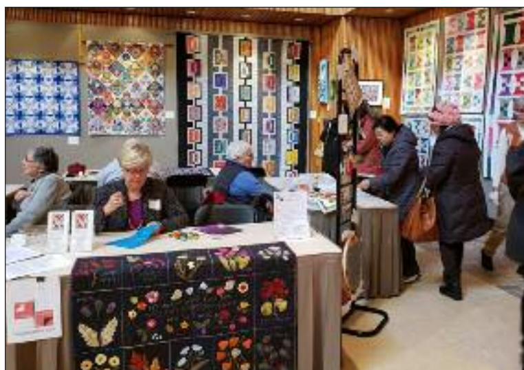
IQI Educational Table at the FAOF