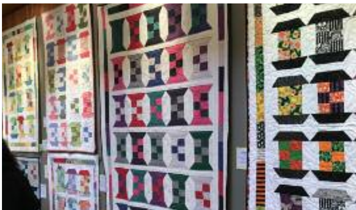
Mystery quilt tops at Quilt In 2019 (above, left). Mystery quilts at FAOF 2019 (below, left).