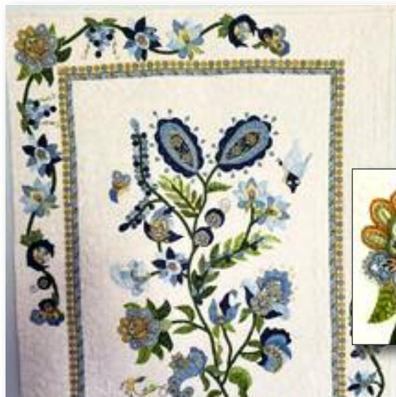
close-up of border