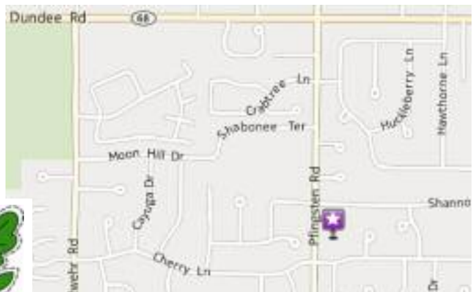
Gloria Dei Lutheran Church, Northbrook