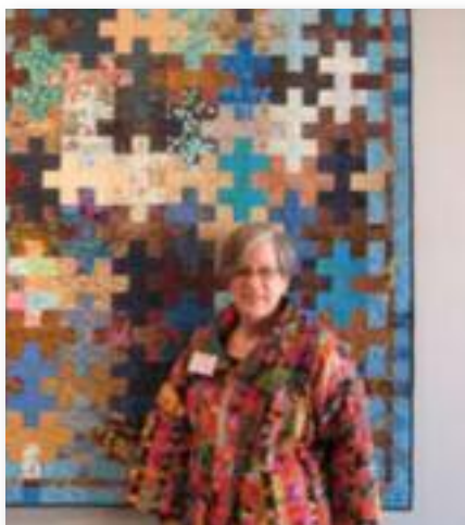
One of several "puzzle" quilts I made. I also pieced the jacket—my version of Jacob's coat of many colors.

I call this one Vevey Pops as the poppy heads were printed on silks and cottons via my inkjet home printer, then sandwiched with batting, quilted, embellished and floated on a background of an upholstery-weight velour. This shows it as work-in-progress but I did complete it and consider it to be one of my more successful attempts at creating art.