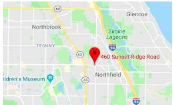
Lutheran Church of the Ascension, Northfield 460 Sunset Ridge Rd. (at Willow Rd.)

Over 300 quilts, merchant mall, boutique, "Diana" exhibit by Cherrywood List of vendors and more info at www.sinnissippiquilters.org