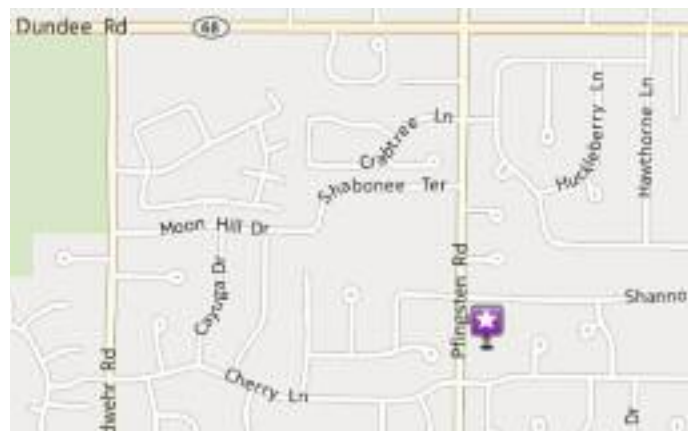
Gloria Dei Lutheran Church, Northbrook 1133 Pflingsten Rd. at Cherry Lane