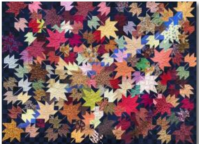
New Leaf for Retired Ties the 2022 IQI Raffle Quilt.