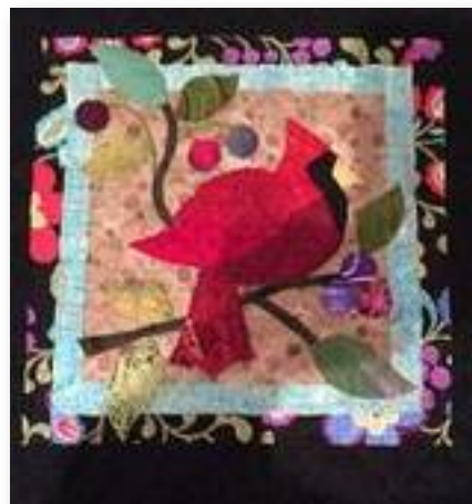
I've made more than two dozen of these little Illinois Cardinal quilts through the years. Most have been donated to the guild for the Silent Auction at the Fine Art of Fiber.