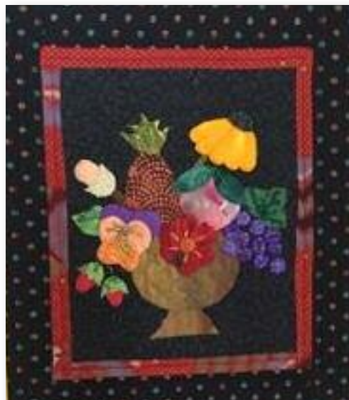
A small framed appliqué and embellished quilt I made in the last several years; represents some of my current quilting style and size.