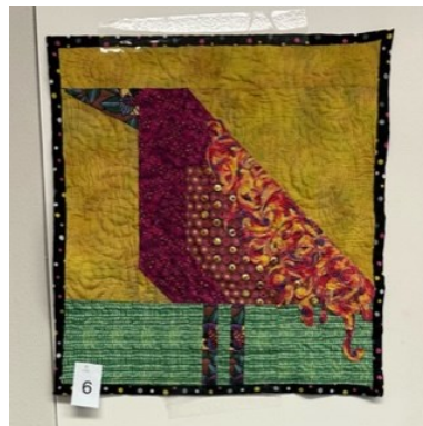
2nd - Staci Raymond