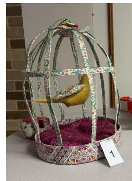
3rd - Ariel Tower