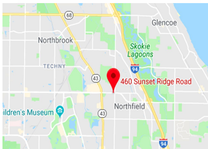
Lutheran Church of the Ascension, Northfield 460 Sunset Ridge Road (at Willow Road)

https://www.americanquilter.com/quiltweek