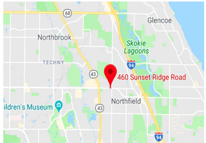
Lutheran Church of the Ascension, Northfield 460 Sunset Ridge Road (at Willow Road)

October 20-21, 2023 - 9am to 5pm: Quilts from the Village XVIII. Village Quilters of Lake Bluff/Lake Forest , College of Lake County, Grayslake, IL.